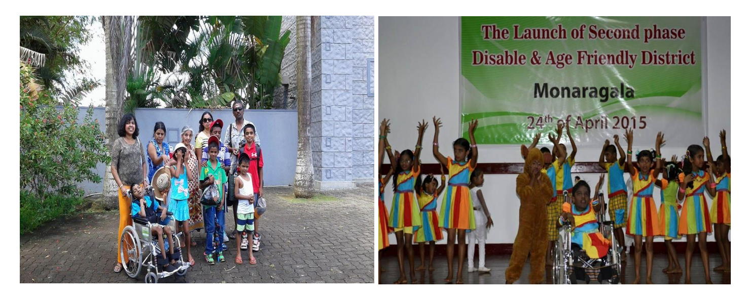
A family trip